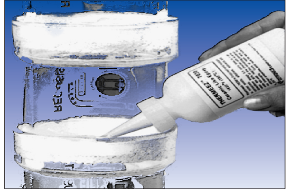
Thermeez™ 7030 Seals a Corrosion Resistant Exhaust System

Commonly used in high temperature exhaust systems, diesel engines, gas turbines, heating plants, etc.